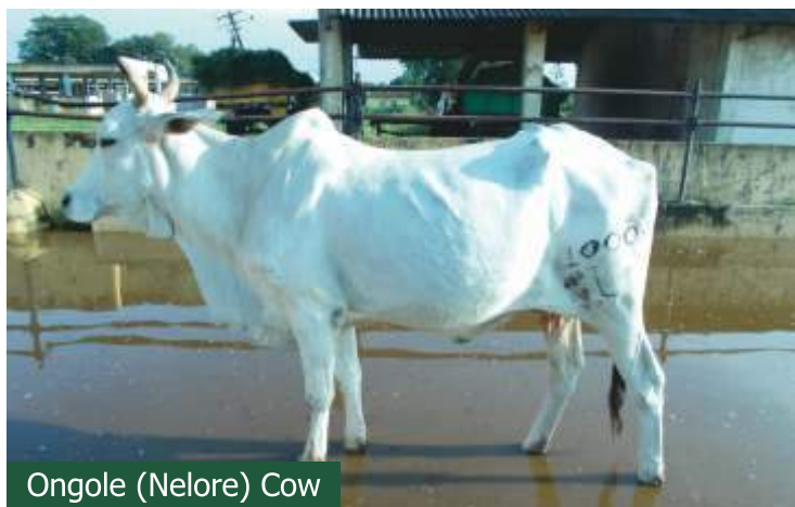
Ongole (Nelore) Cow

An OPU-IVF project was signed between Sri Venkateswara Veterinary University, Tirupati, Andhra Pradesh and JK Trust on 1 st February, 2017 to initiate IVF activity in the State by implementing a Project titled - "Usage of Ovum Pick Up (OPU) and In-Vitro Fertilisation (IVF) Technology for Conservation & Propagation of Indigenous Cattle Breeds of Andhra Pradesh". As per the MoU, JK Trust shall produce a minimum of 510 freezable IVF embryos of Ongole and Punganur breeds.