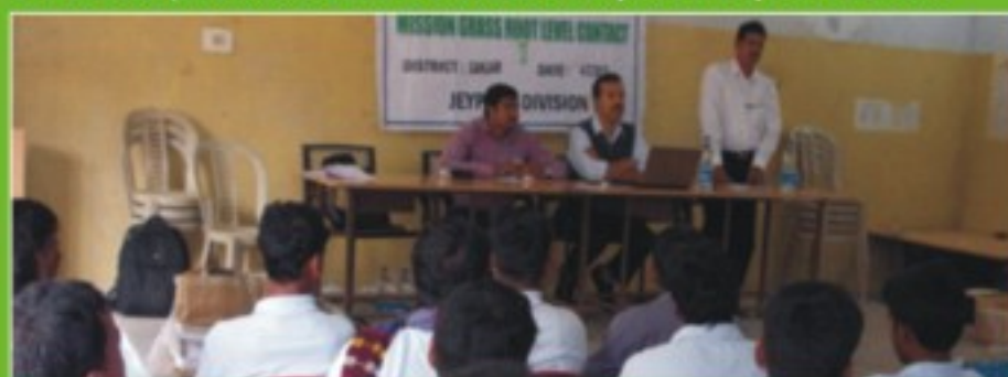
MGRLC-II at Ganjam, Seen from left are APM, SPM and Nodal Officer, NPCBB