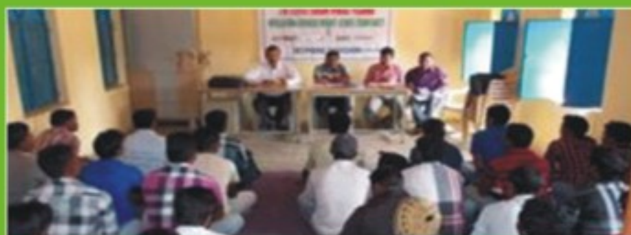
MGRLC-II at Koraput

The Gopals were also given the opportunity to express their views about operational problems. During the meetings, the best Gopals from each of the MOs' operational ILDCs were awarded on the basis of their performance. This programme has been very well received by the Gopals and as has been decided, it will be conducted at quarterly intervals.