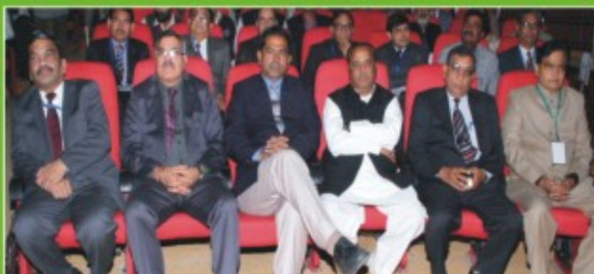
Group of delegates

This seminar was inaugurated by Shri Ashok Gehlot, Hon'ble Chief Minister of Rajasthan. The occasion was graced by Shri Harji Ram Burdak, Hon'ble Minister-