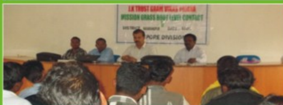
MGRLC-II at Nabarangpur