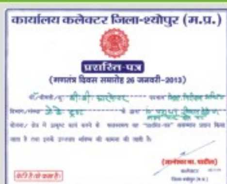
J. K. Trust-GVY received appreciation certificate Sheopur Collectorate on auspicious occasion of Republic Day of year 2013 for providing best veterinary services through 10 ILDC centers in rural areas of Sheopur district under BRGF project