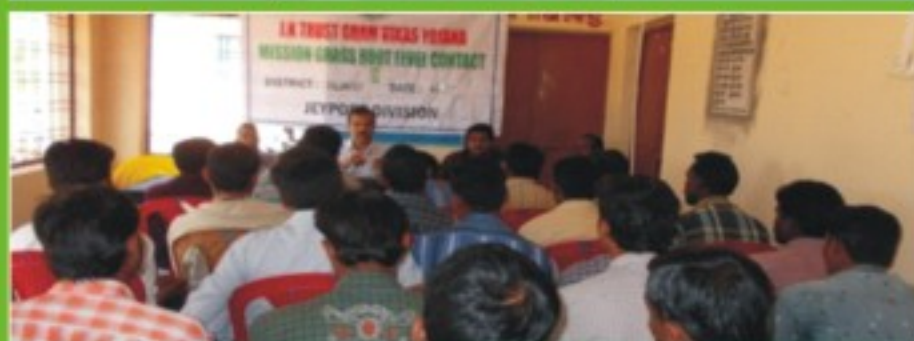
MGRLC-II in Kalahandi