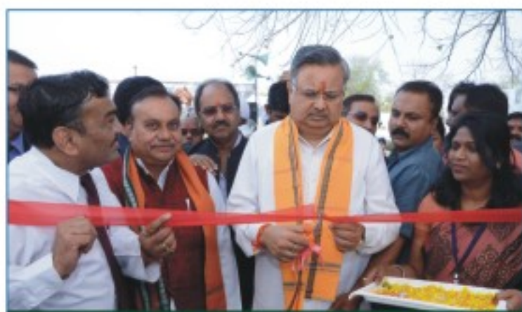
Inauguration of Mobile Veterinary Service by Dr. Raman Singh, Hon'ble CM of Chhattisgarh state